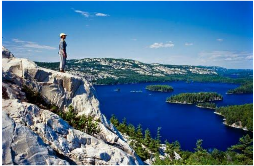
Killarney Provincial Park

On this excursion, we will visit many interesting places in the northern reaches of Lake Huron. The United States and Canada share a common landform in the Niagara Escarpment. Drummond, St. Joseph, Manitoulin and other smaller Islands are all a part of this landform. On these islands are found interesting plant communities, unique rock formations, and attractive shorelines with clear blue waters. We will also walk upon the ancient rock outcroppings of the Canadian Shield when we visit Killarney Provincial Park. The La Cloche Mountains here prominently display domes of unusual white quartzite. Maple, birch and aspen trees should provide good color at this time of year. Local Ojibway First Nation culture is a part of the experience when visiting Manitoulin Island.