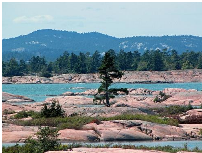
Islands near Killarney

Responsibility: Sarett Nature Center reserves the right, at their sole discretion, to make changes in the itinerary and hotels should that become responsible to any person for or happenings resulting from Sarett Nature Center reserve retain any person as a responsible for any losses or injuries, expenses, or by any tour member.