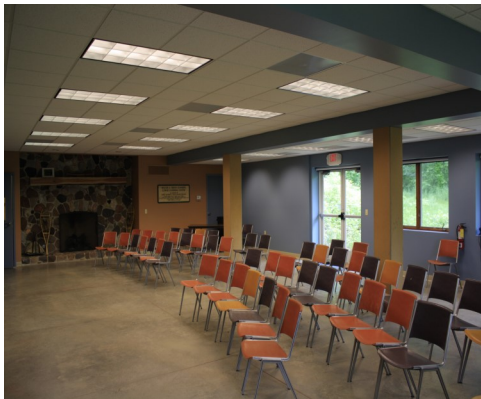
Updated January 1, 2020