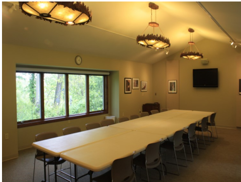
Above: Edna Norris Classroom